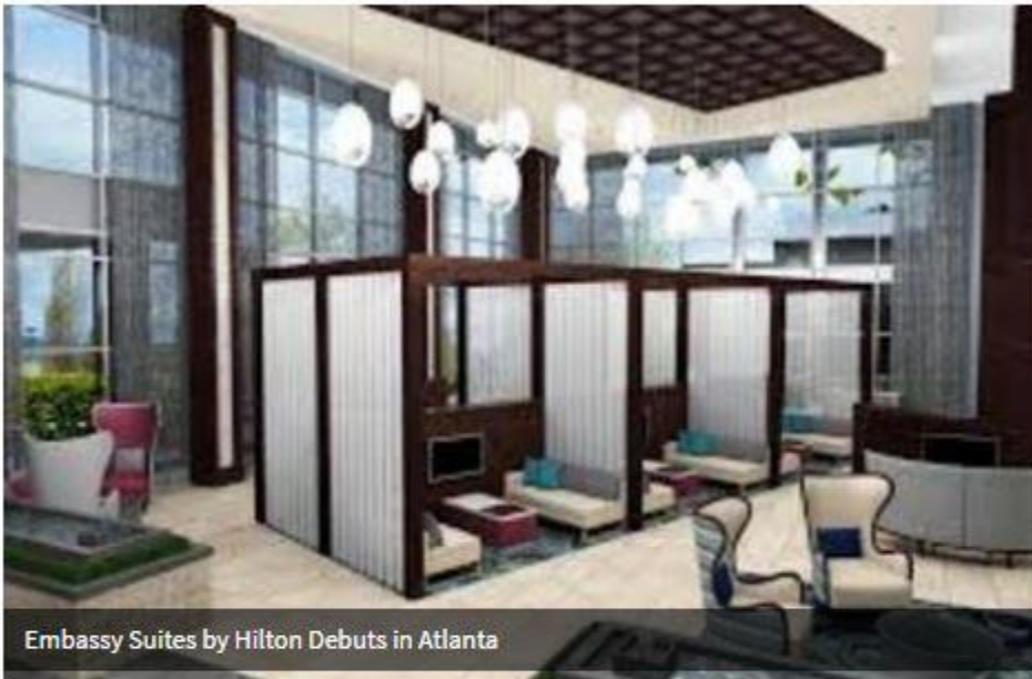
Embassy Suites by Hilton Debuts in Atlanta

Located Adjacent to Infinite Energy Center and Convenient to Downtown Atlanta, it Welcomes Guests to the Growing Sugarloaf Suburb