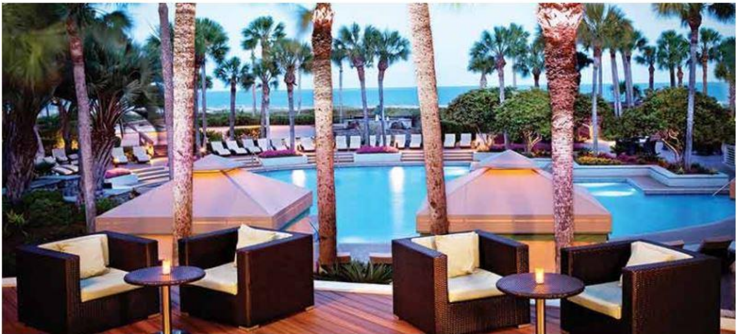
The Westin Hilton Head Island Resort & Spa