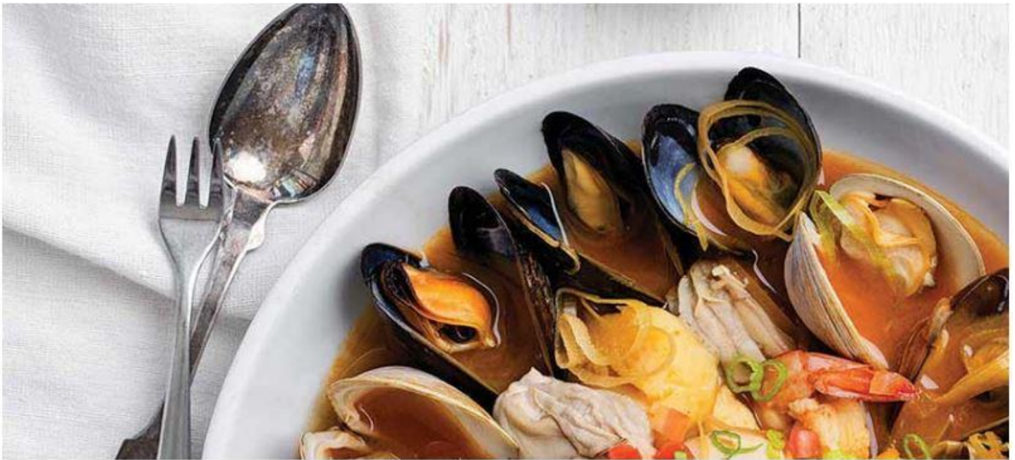
Platter at Hank's Seafood, Charleston