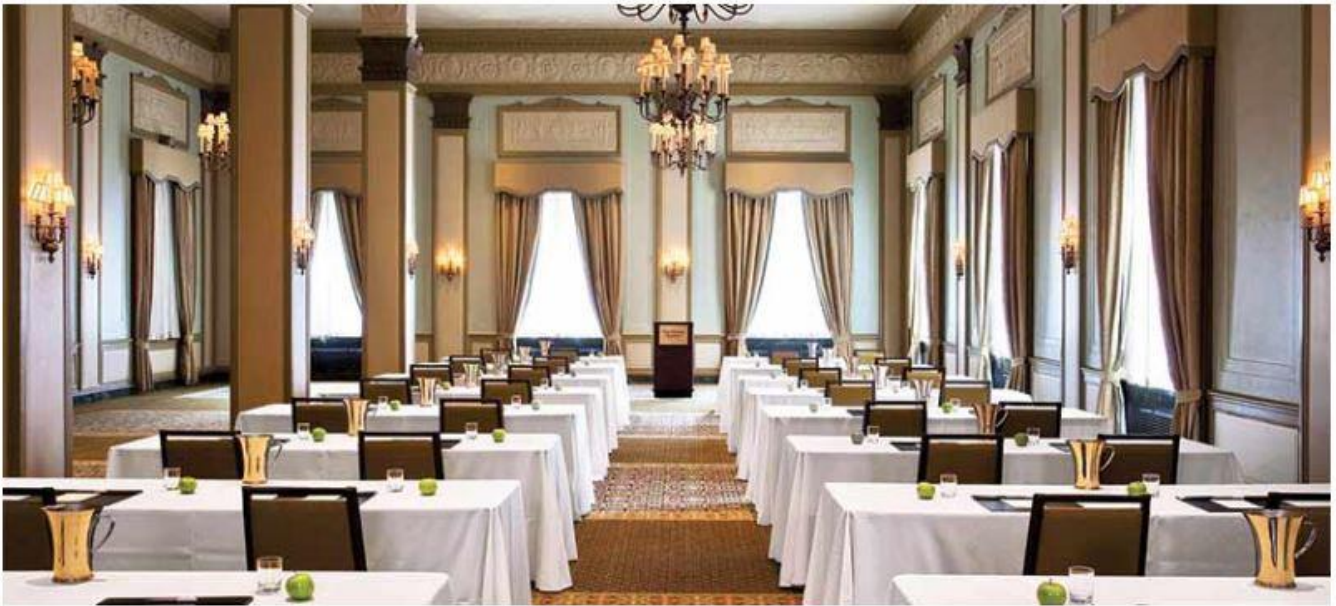
Ballroom at The Westin Poinsett, Greenville

Situated in the foothills of the Blue Ridge Mountains, Greenville is now being sought out for its culinary offerings. Some 600 restaurants fill the city, which is on the verge of becoming a gastronome's haven, with 30 more new restaurants opening in 2017.